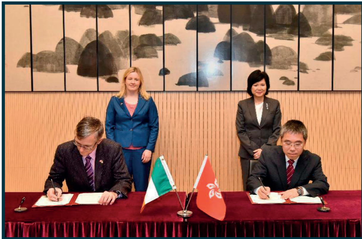
MoU signing ceremony between QQI and EDB on 23 September 2016

The EDB and the QQI signed a Memorandum of Understanding (MoU) in September 2016 for the purpose of strengthening collaboration in the development of their qualifications frameworks, promoting mutual recognition of qualifications and facilitating the mobility of learners and employees between Ireland and Hong Kong.